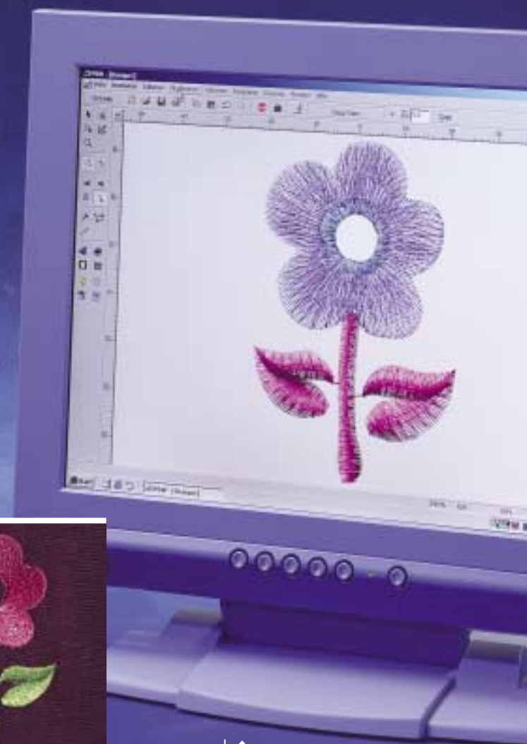
A 3-D preview screen shows your design as embroidered image

Your ideas and the Professional Sew-Ware - an unbeatable team !