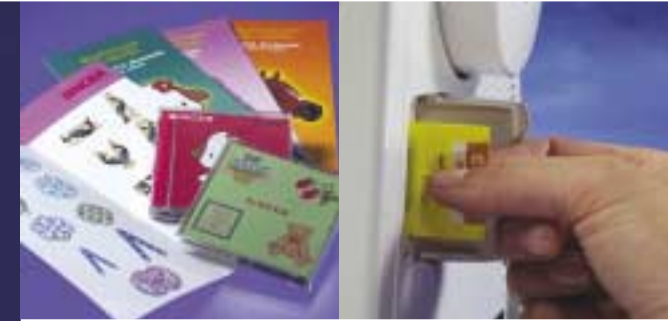
An endless variety of patterns: Smart Media Design Cards

You will find an incredible number of different embroidery designs on the Smart Media Design Cards. And new design cards are constantly being added enabling you to increase your motif repertoire as often as you wish!