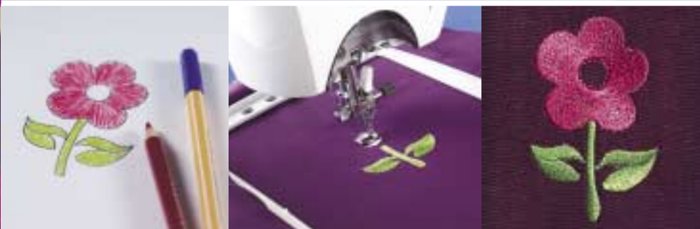
Scan in your favorite motif